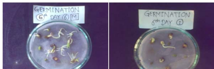
Plates showing germination on 6 th day in Mung.