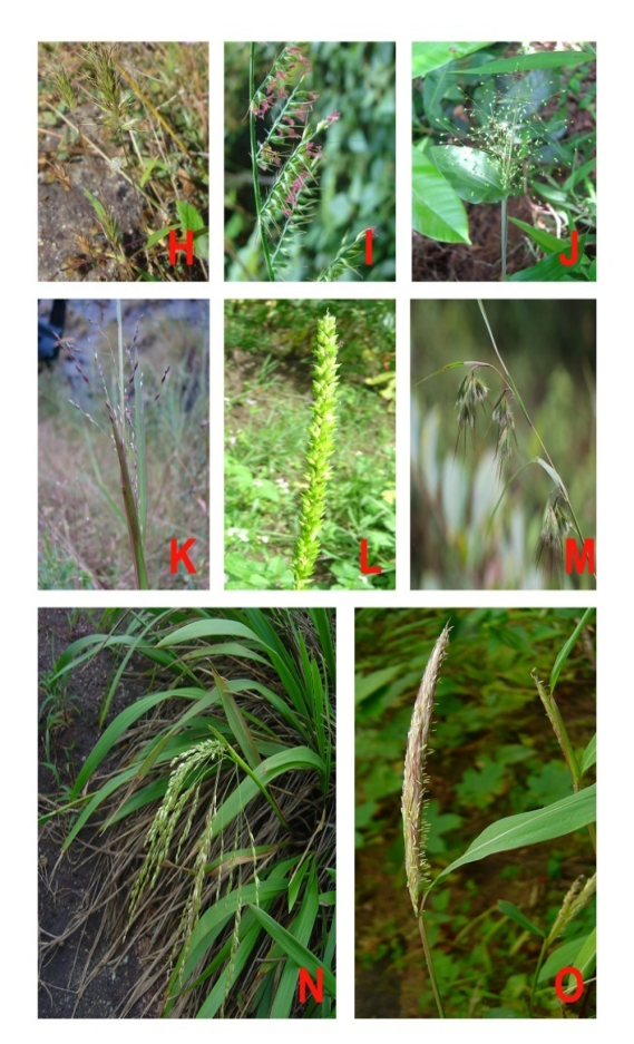
Fig.3. Major grasses of Vagamon Hills H.Jansenella griffithiana, I.Oplismenus composites, J.Panicum brevifolium, K. Panicum gardenerii, L.Sacciolepis indicum, M.Themeda triandra, N. Zenkeria elegans, O.Spodiopogon rhiophorous

In Vagamon, the grasslands are dominated by tall grasses like Cymbopogon flexuosus, Themeda cymbaria etc. Vagamon includes rare species like Zenkaria elegans, Arthraxon lancifolius etc., From the study area 77 species of grasses were collected.