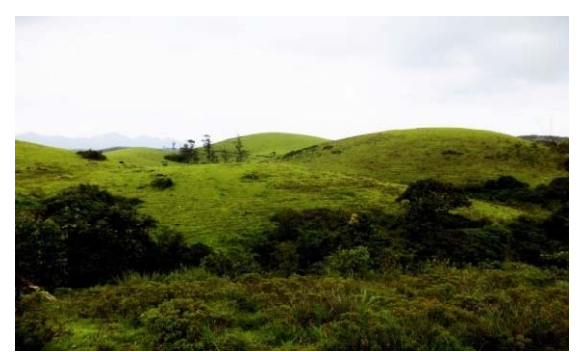
Fig.1: TOPOGRAPHY OF VAGAMON

Endemism was surveyed regarding their grassland vegetation. Vagamon hills with rolling grasslands and patches evergreen shola like forests is selected for this study. Vagamon is globally known for its rich grass diversity (Fig.1). It is located at about 60 km from Kottayam and 65 km from Idukki in Kerala, situated at an elevation of about 1100 m above the msl. The vagamon hill station offers us a unique and a different environ in comparison to other hill stations of Kerala. It is picturesquely beautified by a chain of hills namely Thangal hill, Kurisumala and Murugan hill. The hill is notable for extensive grasslands with small patches of thick evergreen sholas.