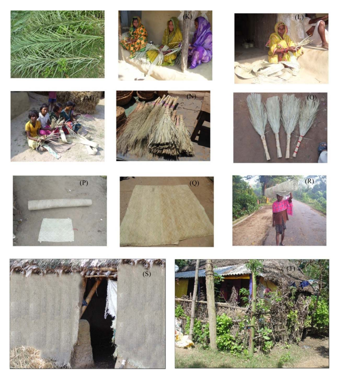
Fig.2. J. Sun drying, K-M. Artisan at work, N-Q. Finished products(brooms and mats used for domestic purpose), R. Man in marketing, S. A mat used in cowshed, T. Leaves used in fencing

landscape specimen found growing over the entire study area. It was observed that natural regeneration of Khajuri trees occurs in five different habitats namely crop fields, roadsides, canal and pond banks and homesteads (Figure 2A, C-F).