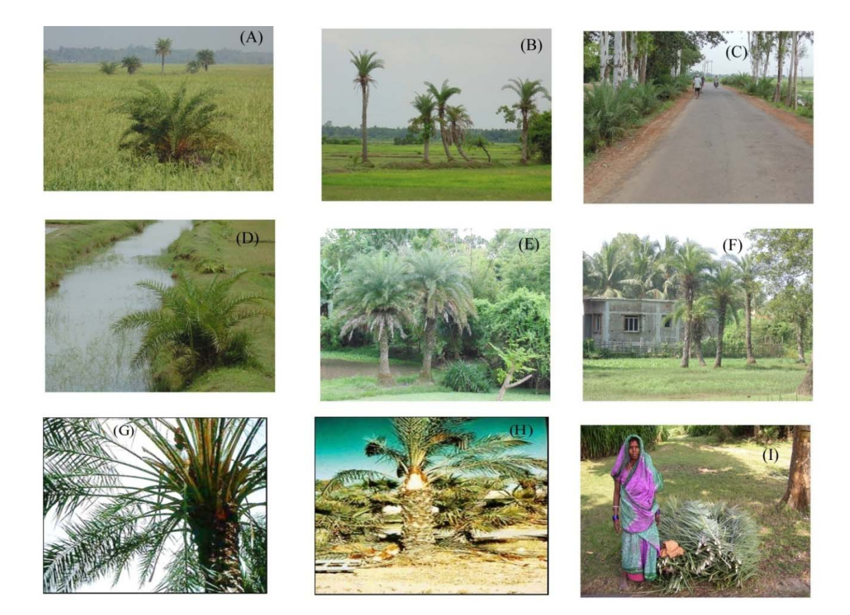
Fig.2.A. Naturally regenerated Khajuri plant in crop field, B. Khajuri plant near the ails, C. Rural scene showing natural regeneration along the road, D. Khajuri plant near the canal, E. Khajuri plant near the pond, F. Khajuri plant near the homestead, G. A farmer in tapping leaves of Khajuri, H. Leaves at ground, I. Collected leaves.

Saxena and Brahmam, 1994) and herbarium Voucher specimen preparation. was deposited in the herbarium of Department of Botany, Chandbali College, Chandbali. Visit to the traditional craftsmen and their workshops were made to collect first-hand information regarding, the mode of collection, processing and preservation; types and method of preparation of craft materials, their trade etc. The data were recorded by consultation with different experienced craftsmen engaged in the same profession.