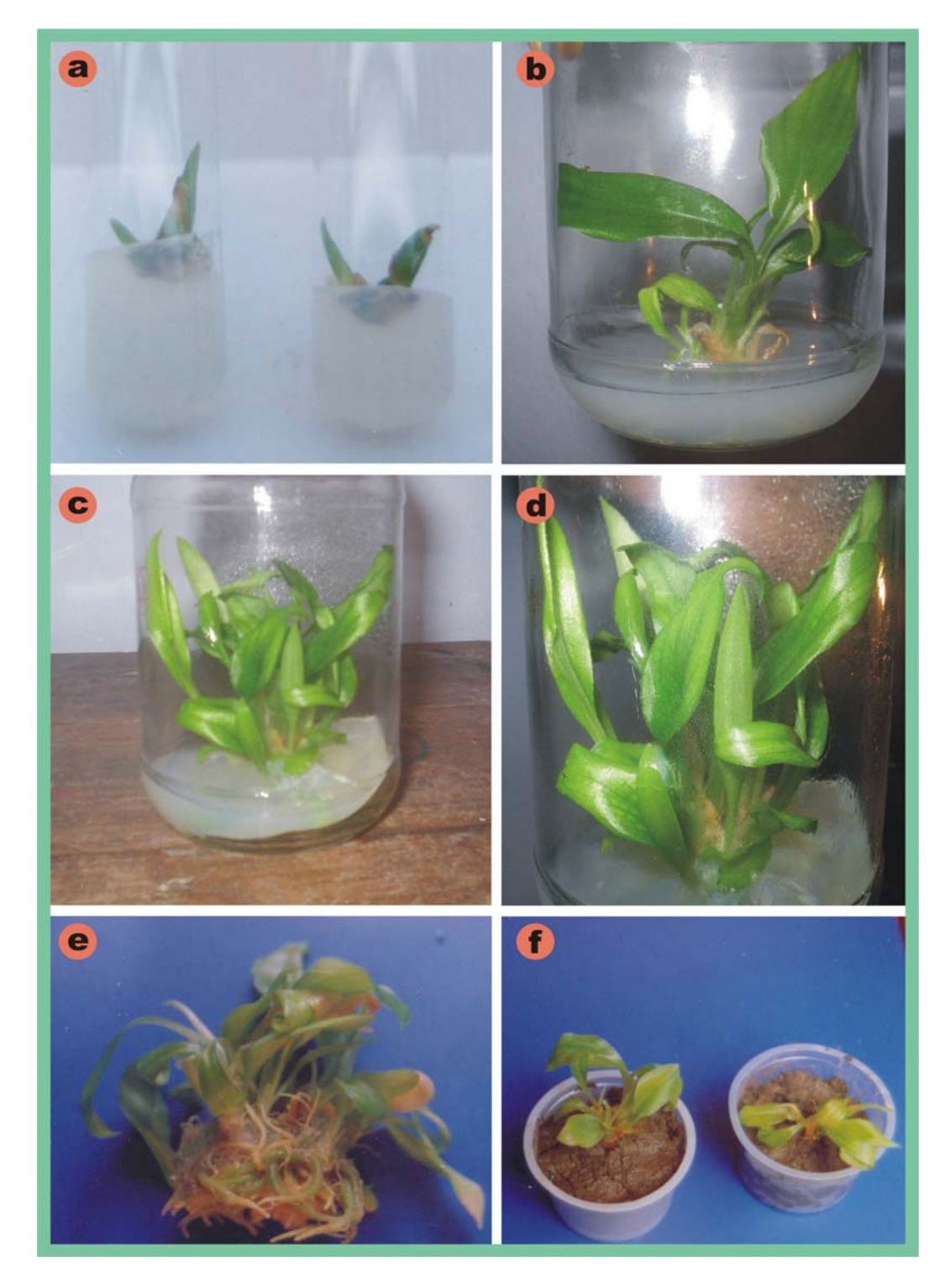
Figure: 2. In vitro sprouting of the explants, b. Regeneration in medium supplemented with BAP 3, c. Regeneration in medium supplemented with BAP & Kinetin 2+2, d. Regeneration in medium supplemented with BAP & Kinetin 3+4, e. Showing in vitro rooting and f. Hardening of plantlets.