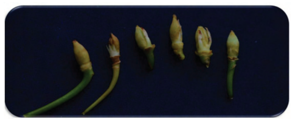
Fig. 2. Intra flower variability in number and length of anthers of hermaphrodite flowers