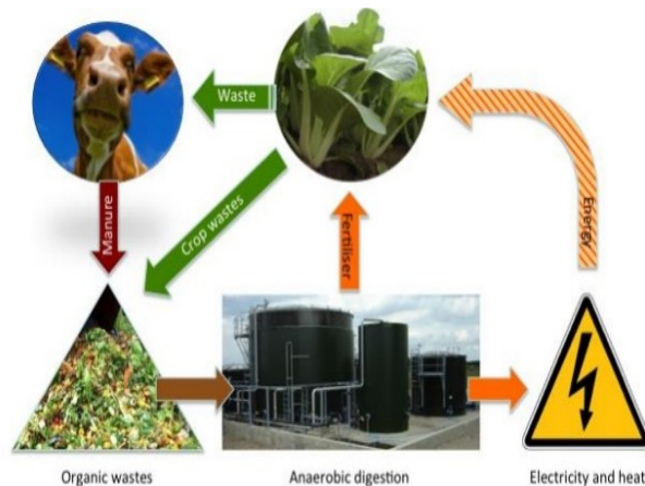
Fig.1. Different feedstock