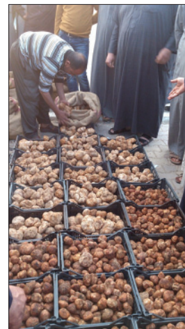
Figure 2: Main market of vegetables and fruits in Hit, February 2014