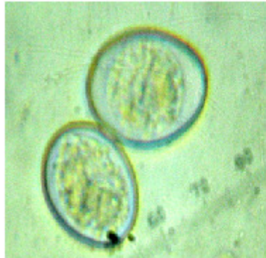
Fig 1. Unsporulated oocyst of Eimeria necatrix

The sporulation time of the oocysts was 18-24 hours.