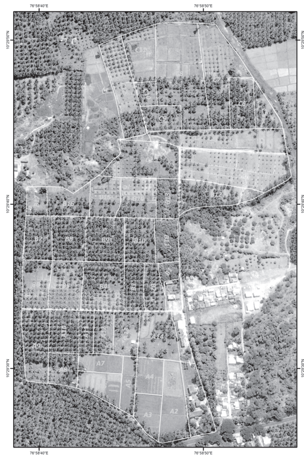
Fig. 1. Farm map overlaid over Quick Bird Satellite Imagery

Three master profiles were examined (Bhattacharya et al. , 2009) one each in the three blocks, soil samples of each horizon of representative pedons were collected, processed and analyzed for important physico-chemical properties employing standard procedures (Sarma et al. , 1987). Surface (0-15 cm) and sub-surface (15-30 cm) samples were collected from all the 43 fields of the farm. Soil fertility parameters viz. , pH, electrical conductivity, \text{KMnO}_4\text{-N} , Olsen P and \text{NNNH}_4\text{OAc-K} were analysed in the soil samples as per the procedures outlined by Black (1965). The soil map was overlaid over Quick Bird Satellite Imagery and digitized (Fig. 1). A database file consisting of data for X and Y coordinates was created in Microsoft Excel. A shape file showing the sampling locations was created in Arc GIS software. The database file was joined to the point data. Thematic maps on available nutrient status (N, P and K) were generated