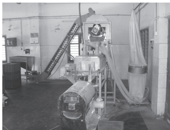
Fig. 1. Impact and shear type peeling machine

Various components of impact and shear type peeling machine (M 1 ) are feed hopper, bucket elevator, revolving perforated drum, pneumatic peeling system and rotary kernel grader (Fig. 1). Dried and unpeeled cashew kernels were humidified to enhance its moisture content to 3.6% d.b suitable for the peeling operation. Vibrating feeder transferred a quantity of unpeeled cashew kernels to the horizontal peeling drum through bucket elevator. Centre shaft was fixed offset to centre of the perforated drum and revolved in opposite direction. Kernels passing through clearance between centre shaft and the perforated drum were subjected to impact and shear force by numerous spring loaded hook like structure mounted on the periphery of the centre shaft. During the process fracturing of testa took place and kernels with loose testa were conveyed to pneumatic system wherein high pressure air removed testa layer completely. Later, whole kernel (unpeeled and peeled), broken kernels and remaining testa were segregated in rotary sieve grader and collected in different outlets.